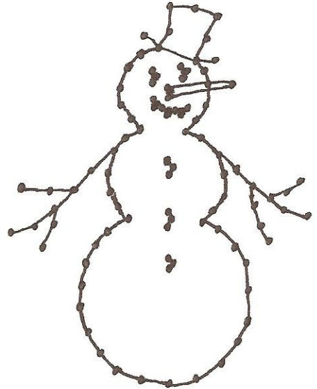
Pattern with thread - example

Line the pattern over cardstock paper. Punch only the dots with an awl or a push pin through the pattern and the cardstock. Only punch holes where the dots are shown on the pattern. Then stitch through the punched cardstock using a cross-stitch needle and thread. Use all 6 strands of thread and tie knots on the under side when you begin and when you finish. Look at the stitched example for help.